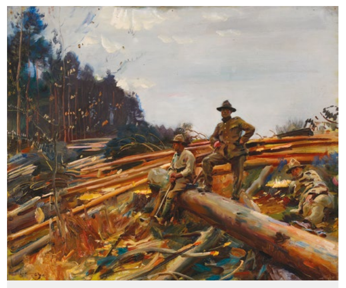
Alfred Munnings Lumbermen Amongst the Pines

Second World War service files are typically more extensive and personal than those from the First World War, as all documents relating to an individual were retained. In the case of those who died in service, this can include pay books and copies of correspondence with next-of-kin. The documentation between the two wars is otherwise similar as records were likewise required to prove service, pay, and medical details for pension purposes.