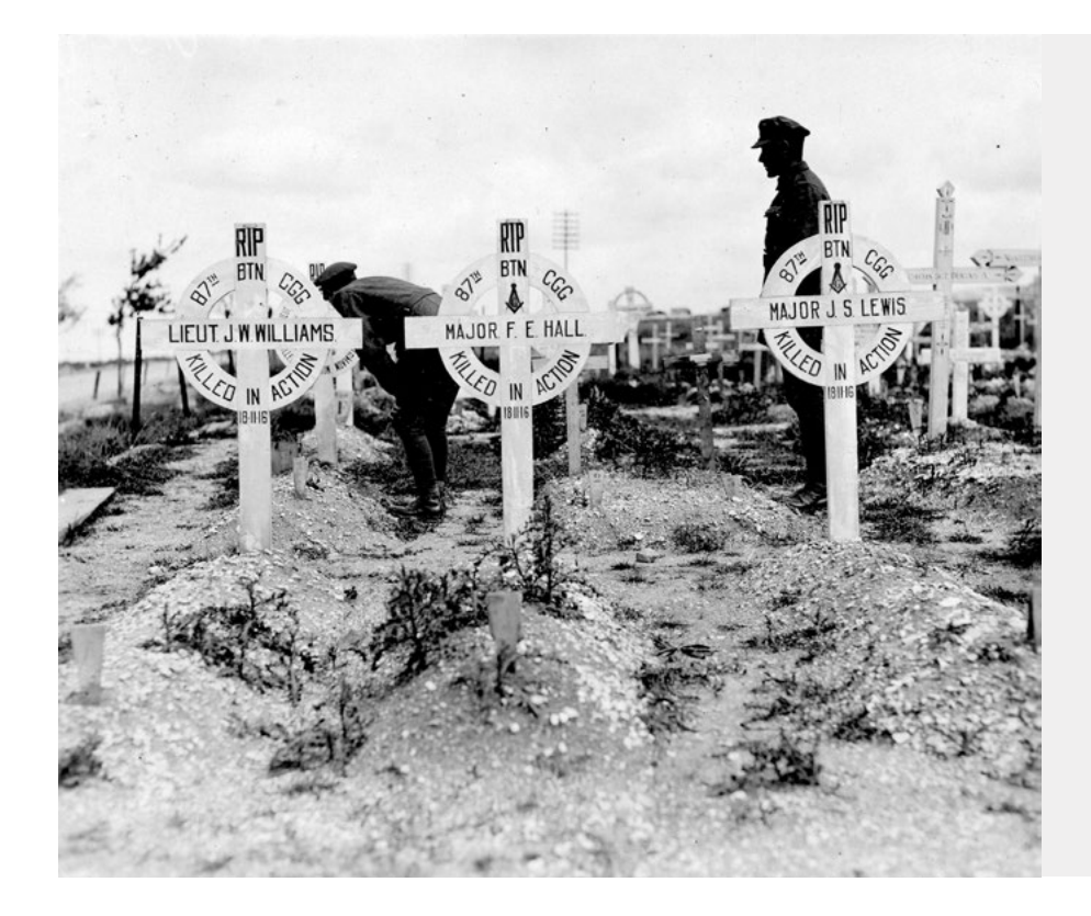
Canadian graves on the Albert Bapaume Road

through the <u>Commonwealth War Graves</u> <u>Commission</u>, the organization responsible for First and Second World War graves and monuments. At LAC, documentation for specific time periods includes the Circumstances of Death and War Graves Registers, and Veterans Death Cards.