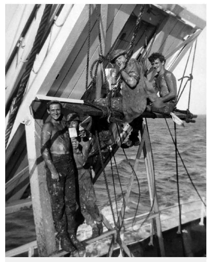
Four young seamen painting a life raft of the SS Temegami while it sails the Indian Ocean

Veterans Affairs Canada also keeps some information on those that served with the Merchant Navy. The information may include a sailor's name, birthplace, age, rank or occupation, next of kin, and a summary of correspondence. Some records also have the individual's Application for Merchant Seaman's Identity Certificate , which includes a photograph and fingerprints. As service information is subject to privacy legislation, an Access To Information and Privacy (ATIP) request must be sent to Veterans Affairs Canada > Other Inquiries > ATIP.