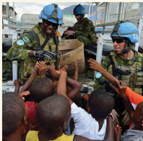
Canadian Peacekeepers in Haiti, 2013