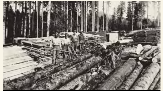
Members of the No. 2 Construction Battalion at work

An introductory visual timeline from pre-Confederation through to the war in Afghanistan.